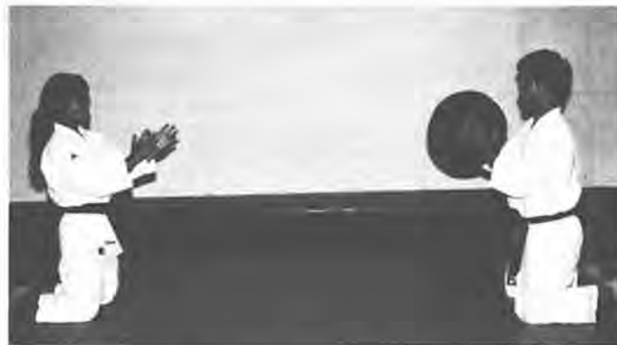
Figure 6. Chest pass - kneeling