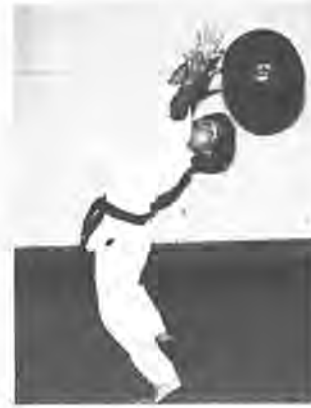
Figures 3 and 4. Back throw - to one side