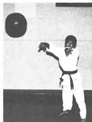
Figure 10 and 11. Torso throw