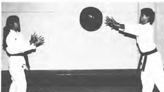
Figure 8. Chest pass - standing

ticularly useful in the twisting movements involved in judo throwing techniques. Medicine balls also keep the athlete aware of his or her center of gravity (6) and hence, improve balance.