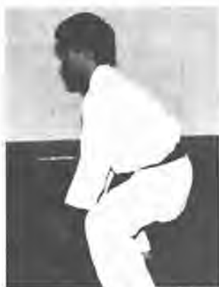
Figure 1. Starting position: back throw

upper body as well as implementing sport-specific exercise routines" (3). Medicine ball drills can be implemented directly in the "dojo," or training room, allowing for a convenient method of monitoring training. Drills can simulate specific actions not normally reproduced by standard weight-training equipment. One can move the balls freely as a result, and they are par-