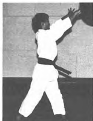
Figure 12. Torso throw, side to side