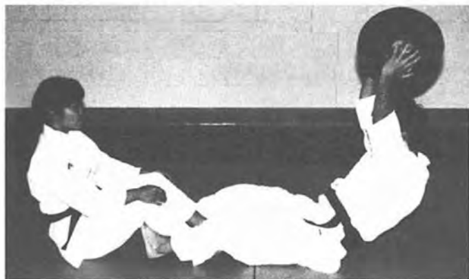
Figure 9. Sit-ups