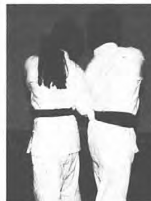
Figure 13, 14 and 15. Trunk passes, back to back