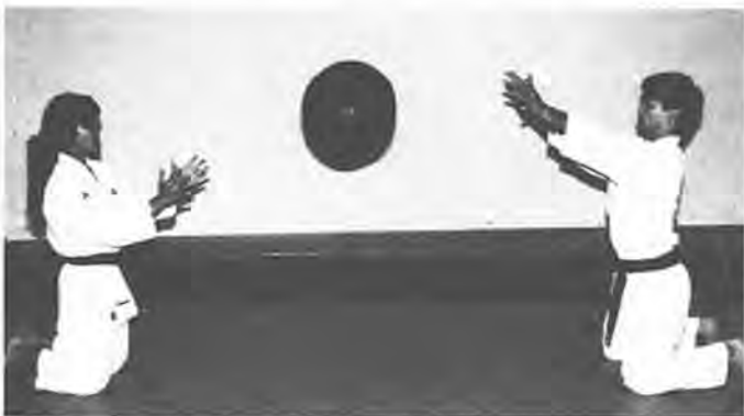
Figure 7. Chest pass - kneeling