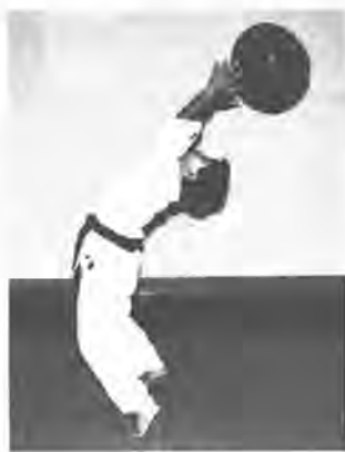
Figure 2. Back throw action sequence